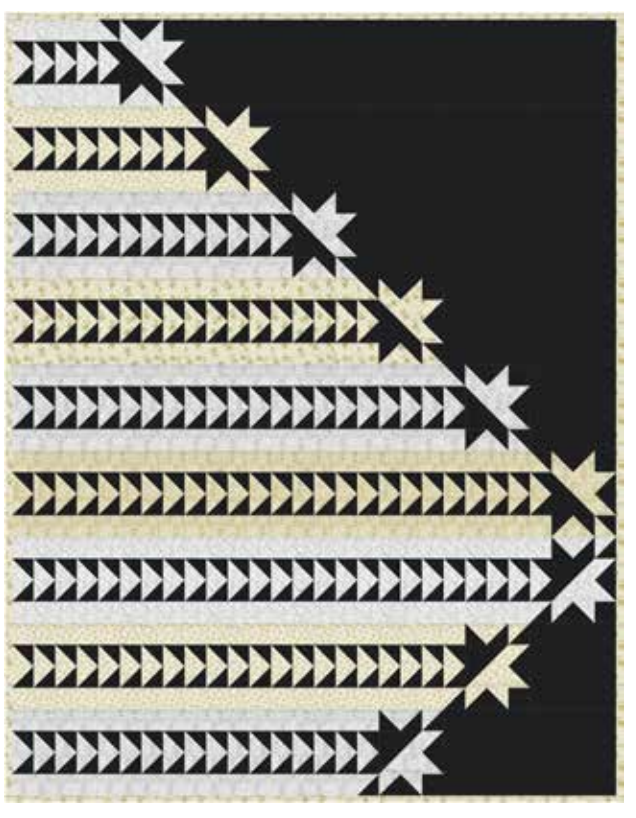
CAC (Crabtree Arts Collective) 102 The Opposite Night 70" x 90"