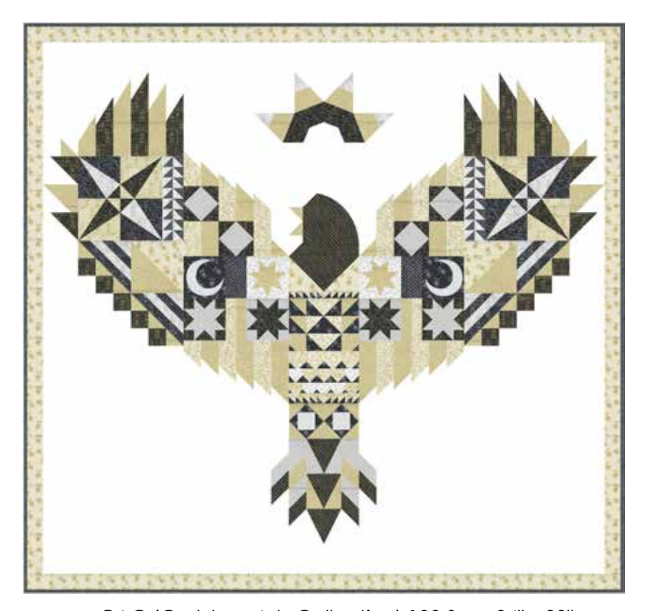
CAC (Crabtree Arts Collective) 103 Soar 84" x 80"