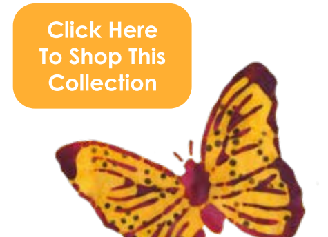
WS 32 Bits and Bobs Light 64" x 88" FQ Friendly

wax as a dye repellent. The fabric then goes through multiple dye baths of different colors. The wax is then removed to reveal colorful and intricate designs.