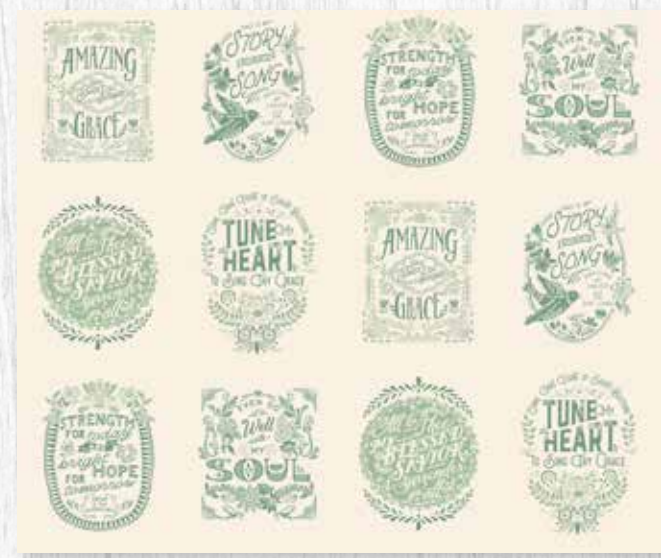
45521 22 Size: 24" x 44". Blocks are 6" x 5.5" or smaller.