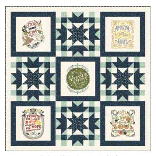
CQ 177 Praises 58" x 58"