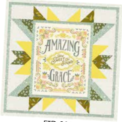
FTD 203 Songbook Pillow Bundle Amazing Grace 20" x 20"