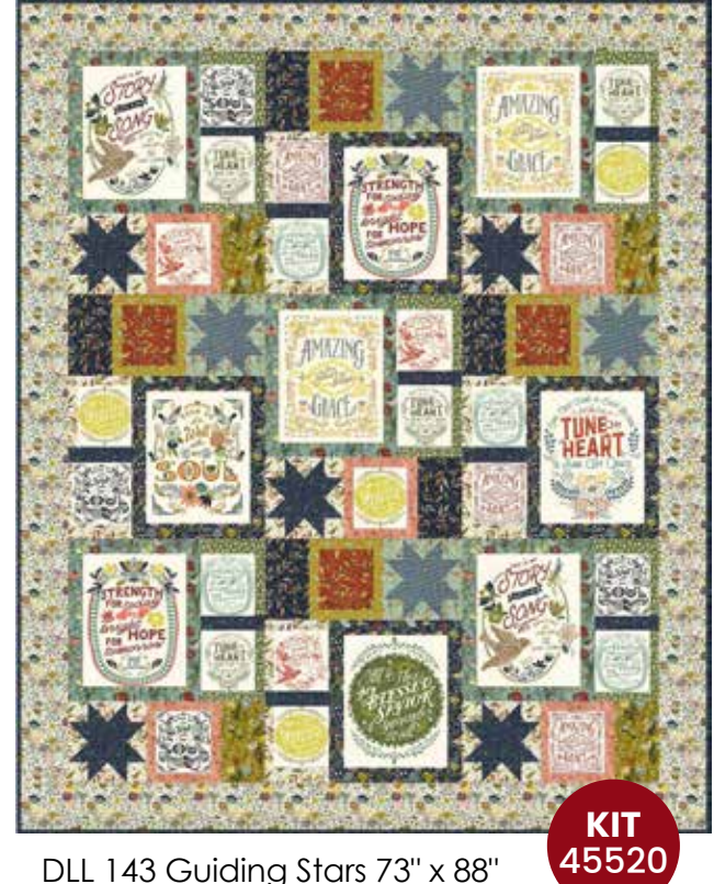
DLL 143 Guiding Stars 73" x 88"