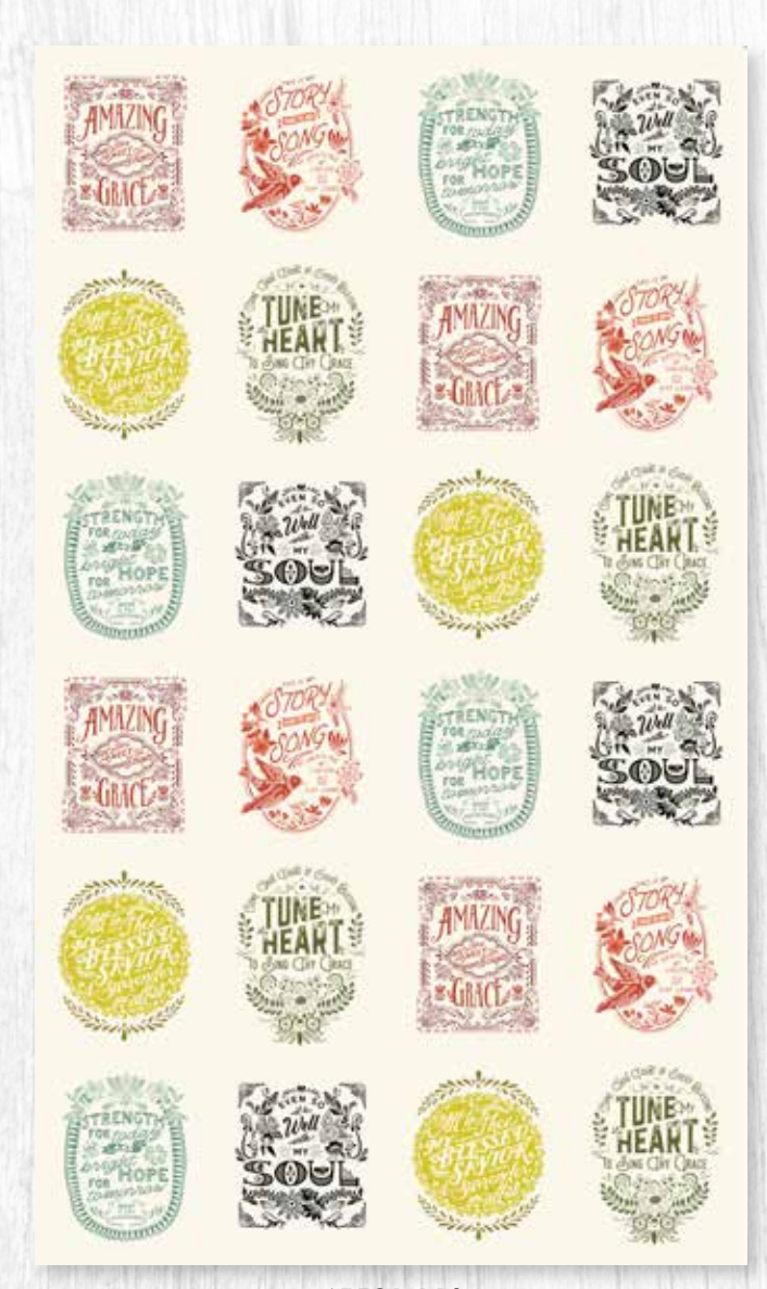
45521 11* Size: 24" x 44". Blocks are 6" x 5.5" or smaller.