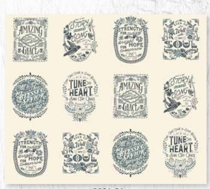
45521 21 Size: 24" x 44". Blocks are 6" x 5.5" or smaller.