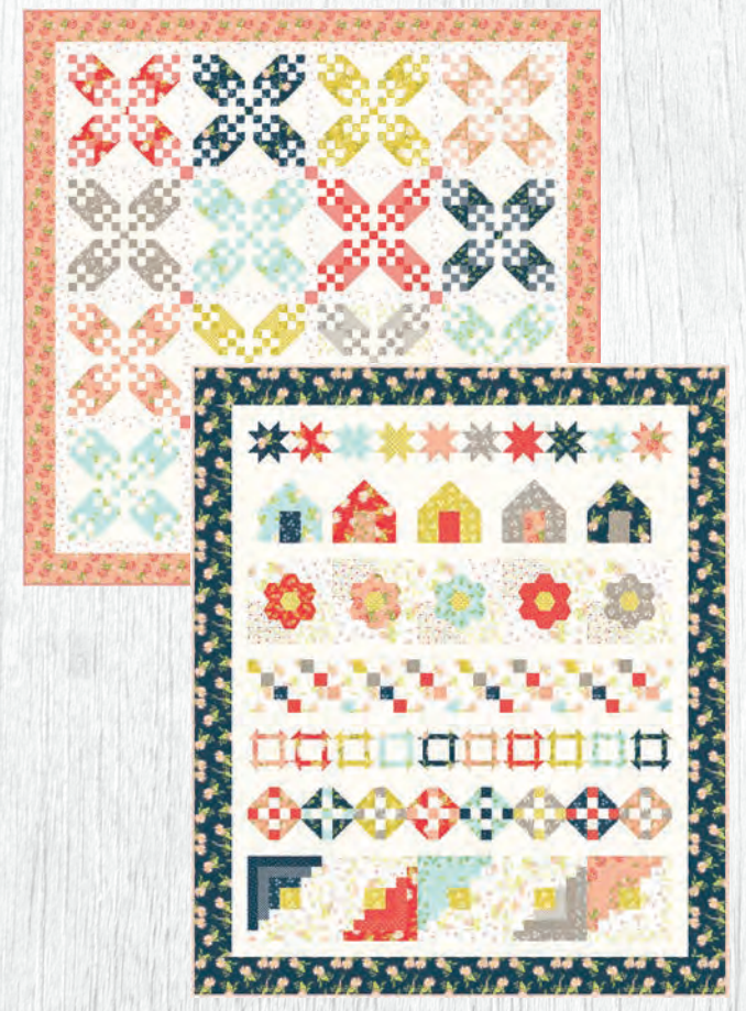
QLD 197 Beach House - 49"x 58" F8 Friendly