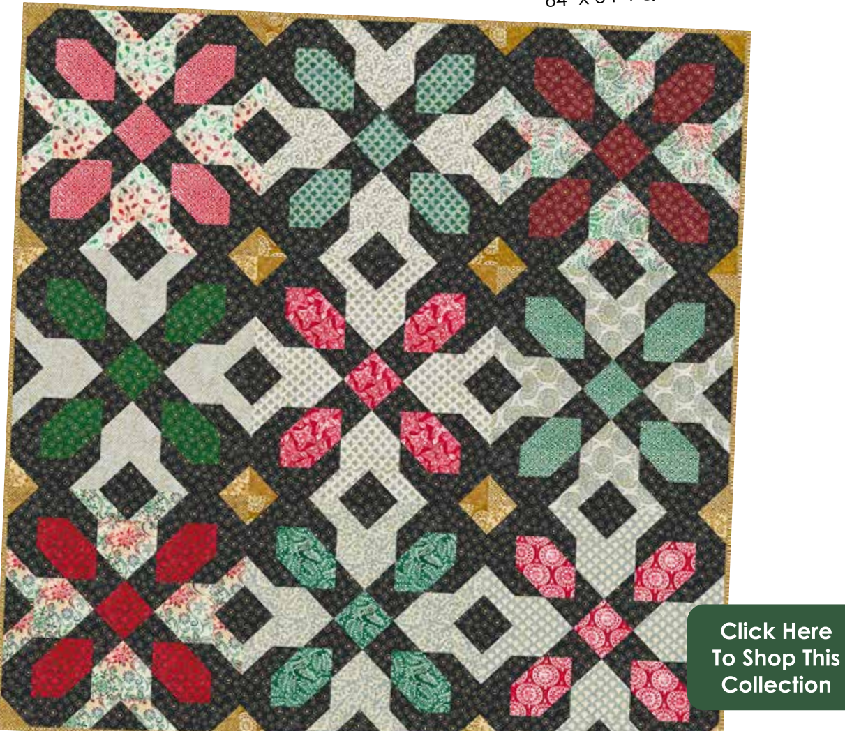
KS 2002 Blizzard 73" x 73" FQ Friendly