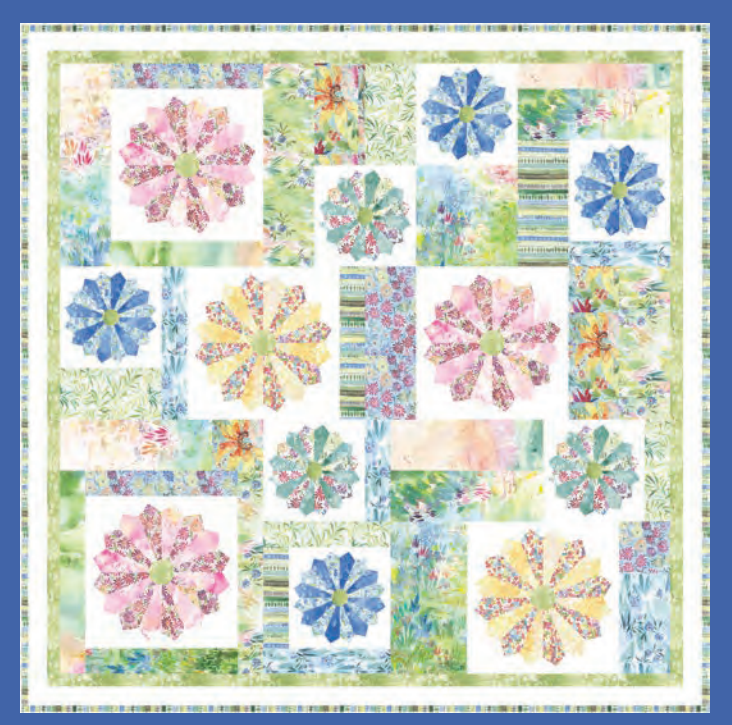
CJP 2202 Fleur 53" x 53"