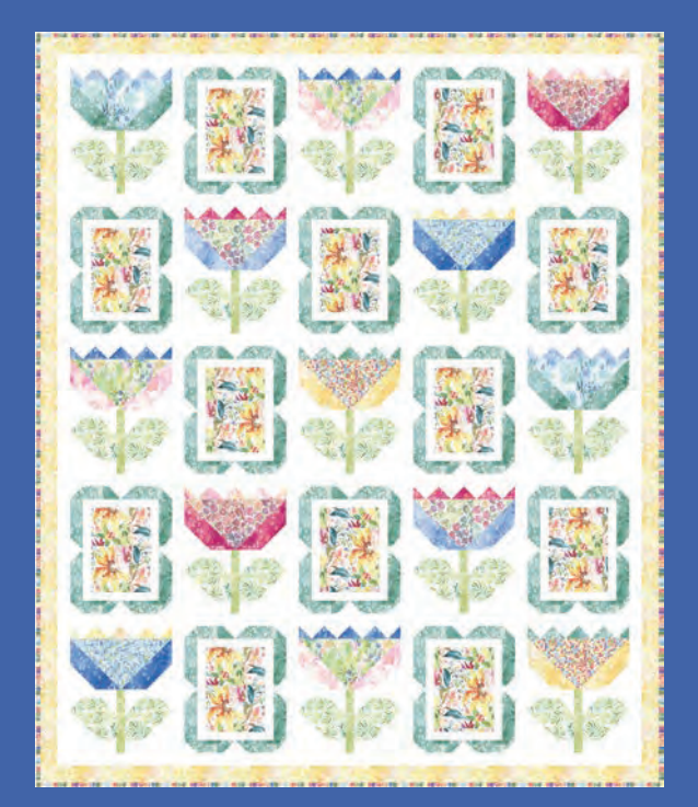
CJP 2203 Tulips to Tango 73" x 88"

Panel is 58" x 80". Min 2 Packaged in polybag with header.