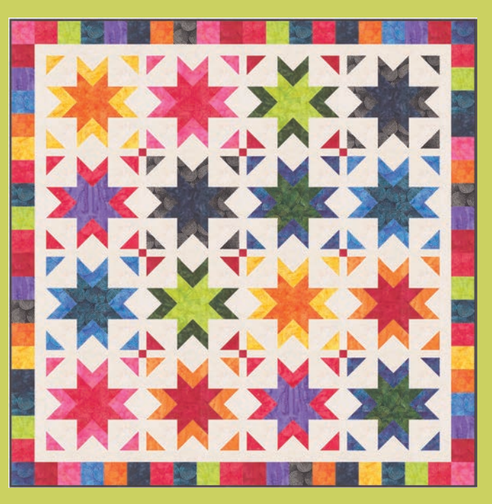
WS 30 Sparklers 60" x 60" by Wendy Sheppard