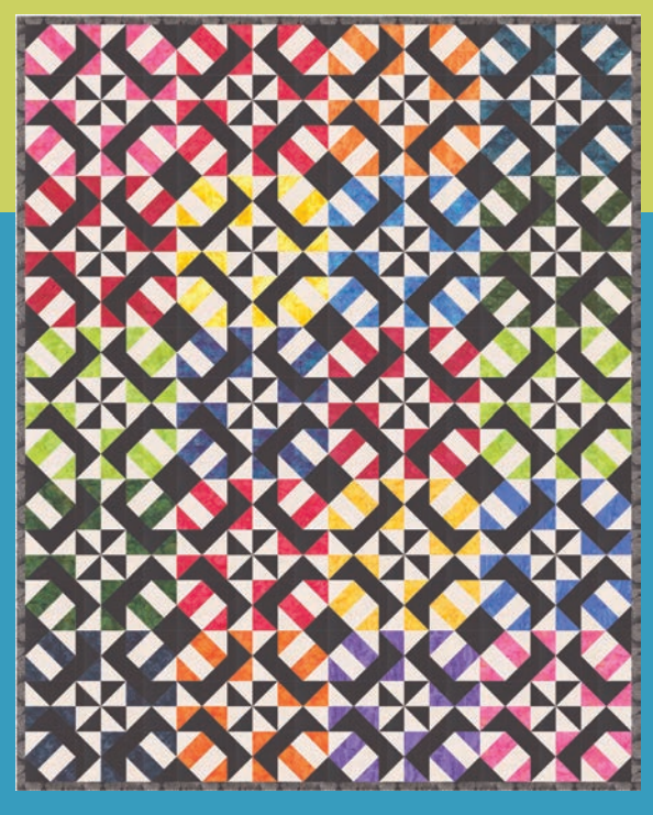
HQ 117 Corkscrew 70" x 90" F8 Friendly by Happy Quilting