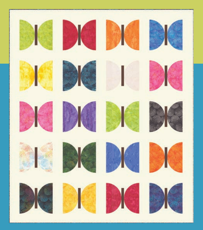
LBS 116 Metamorphosis 72" x 84" AB Friendly by Lo and Behold Stitchery