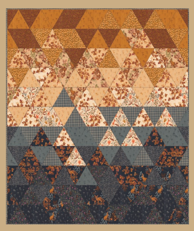
LBS 112 Triangle Fade 58" x 69" by Lo and Behold Stitchery