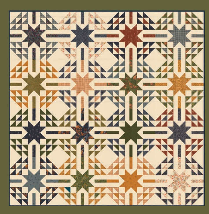
MM 006 Aglow 64" x 64" AB Friendly by Modernly Morgan