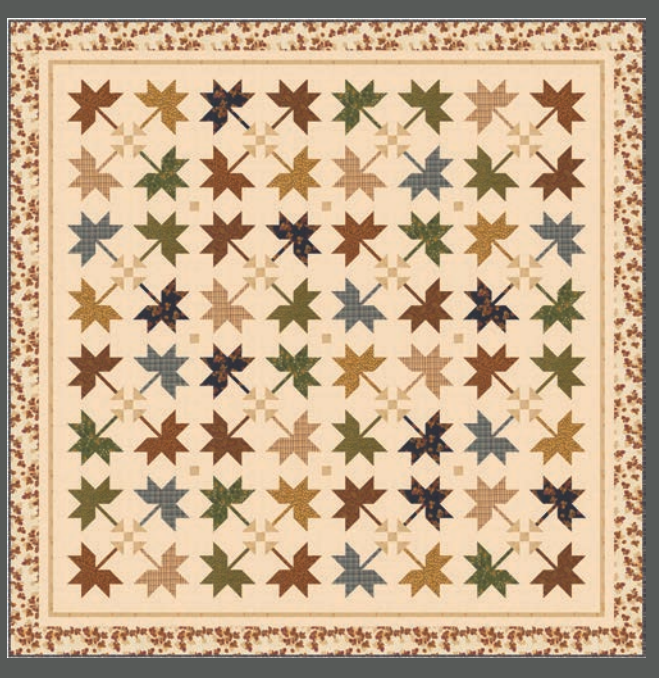
WS 95 Beleaf You Me 67" x 67" by Wendy Sheppard