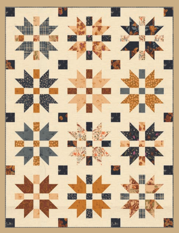
LBS 102 Christmas Joy 54" x 71" by Lo and Behold Stitchery