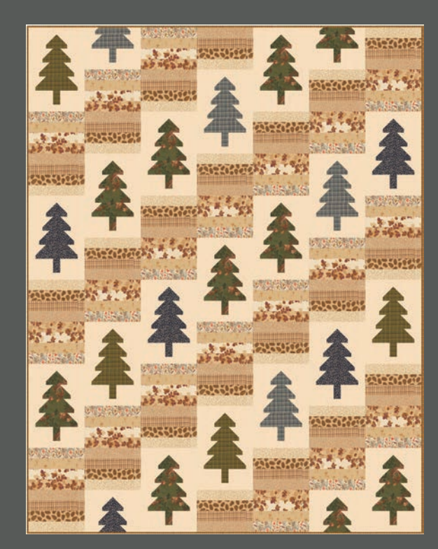
WS 74 Tree-mendous 56" x 72" by Wendy Sheppard