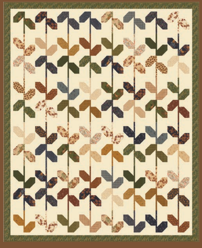
CHD 2453 Twisted Vines 70" x 86" LC Friendly by Coach House Designs