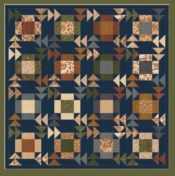
CKQ 2402 Skybound 75" x 75" by Copper Kettle Quilt Company