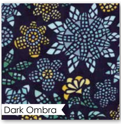
27252 12 *