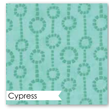
27256 23 *