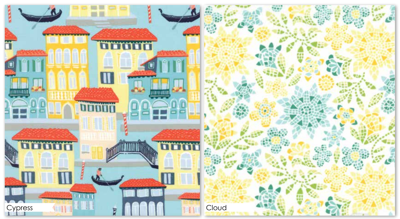
27250 13 *