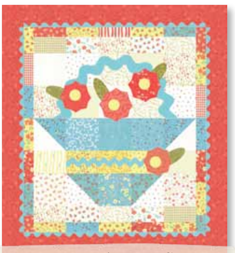
PH 514/ PH 514G Perfect Arrangement Quilt 30\frac{1}{2} " x 33"