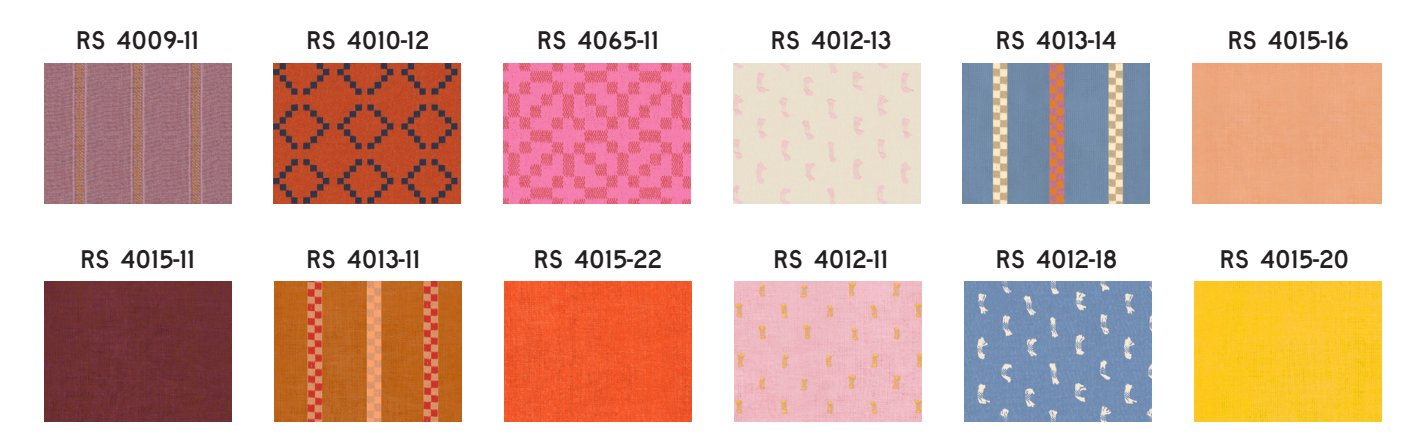
Need 1/3 of all fabric below | Cut each into (6) 4½" x 10½" rectangles